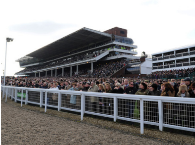
CS Jockey Club 04162020