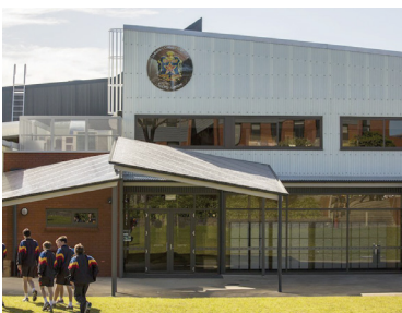
CS St. Bede's 04242020