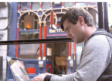
CS eir 05042020